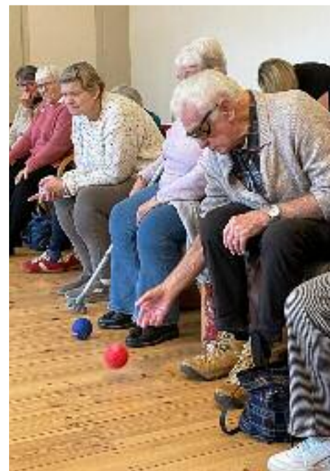
Boccia at the Bury St Edmunds Club

For more information about any of our clubs, please contact the office on 01473 611011 or email info@suffolksight.org.uk