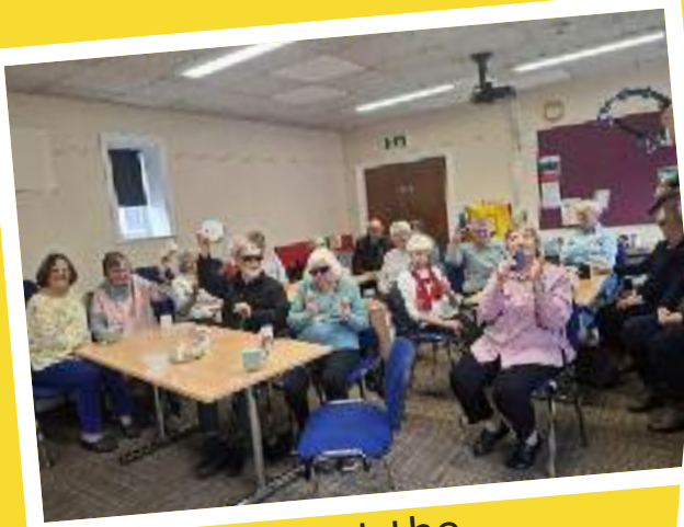
A sing-along at the Hadleigh Club

This is just a small selection of photos from a few of the 16 Suffolk Sight Clubs, showing the range of activities offered and the fun that our club members have.