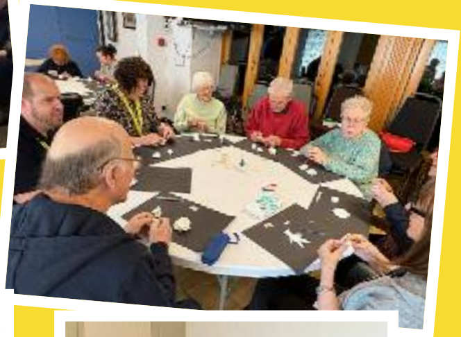
Clay modelling at the Haverhill Club