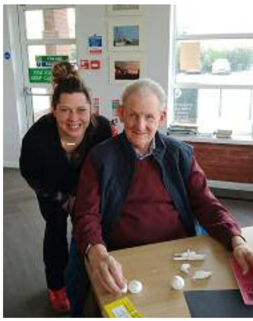
Clay modelling at the Halesworth Club