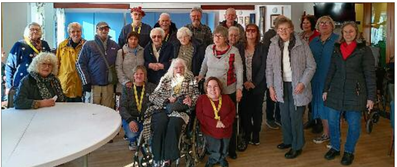
Image shows members of the Haverhill Club who took part in the Healthwatch Suffolk survey.

This project has formed part of Healthwatch Suffolk's Your Care Your Way campaign, which aims to raise awareness of people's rights to receive clear, accessible and understandable information when making decisions about their health and care.