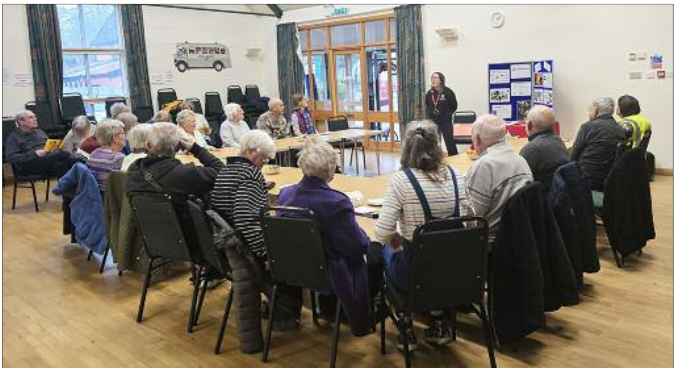
Image shows members of the Pakenham Club enjoying a talk.